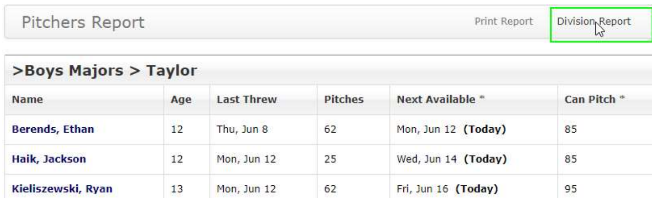
Figure 6. Bring up Division Pitchers Report

D. You can also view the whole division's Pitching Report by clicking on Division Report.