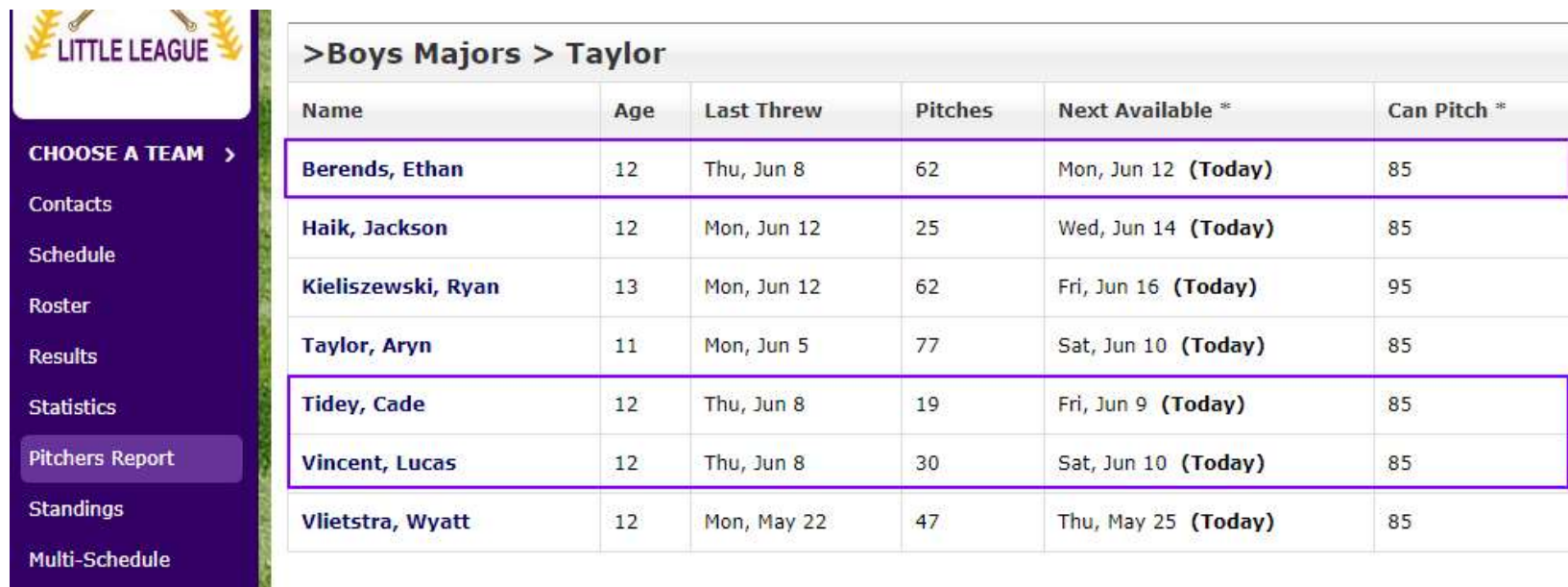
Figure 5. Team Pitchers Report